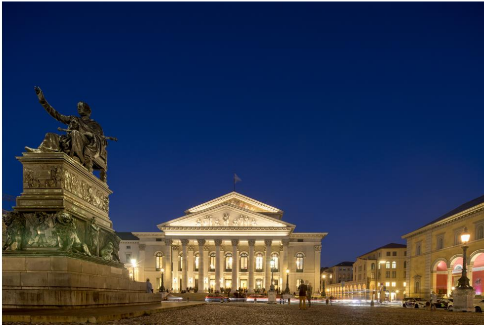
Nighttime Munich has just gained a new highlight.