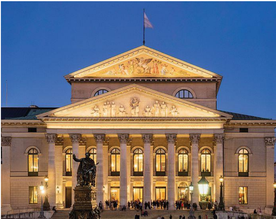
The National Theater in Munich takes on a new glow.

the Bavarian National Theater is now reflected in the outer glow produced by the new façade illumination. It creates a new symbiosis between the stage and façade. Members of the Friends of the National Theater association were happy to help add this new accent to Munich's cityscape and are really excited about the building's new radiance.”