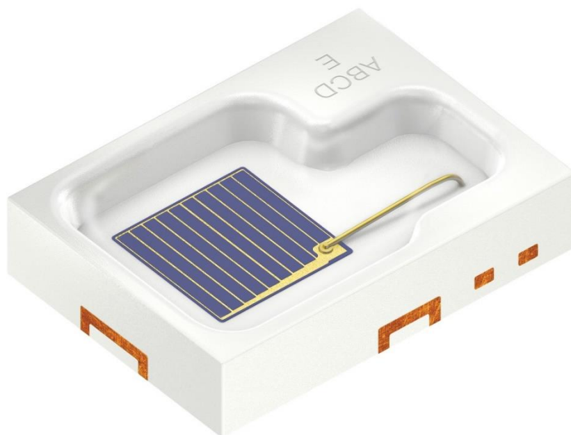
The first infrared LED with 940 nm for 2D facial recognition provides the basis for good quality IR camera images and reduces red glow.