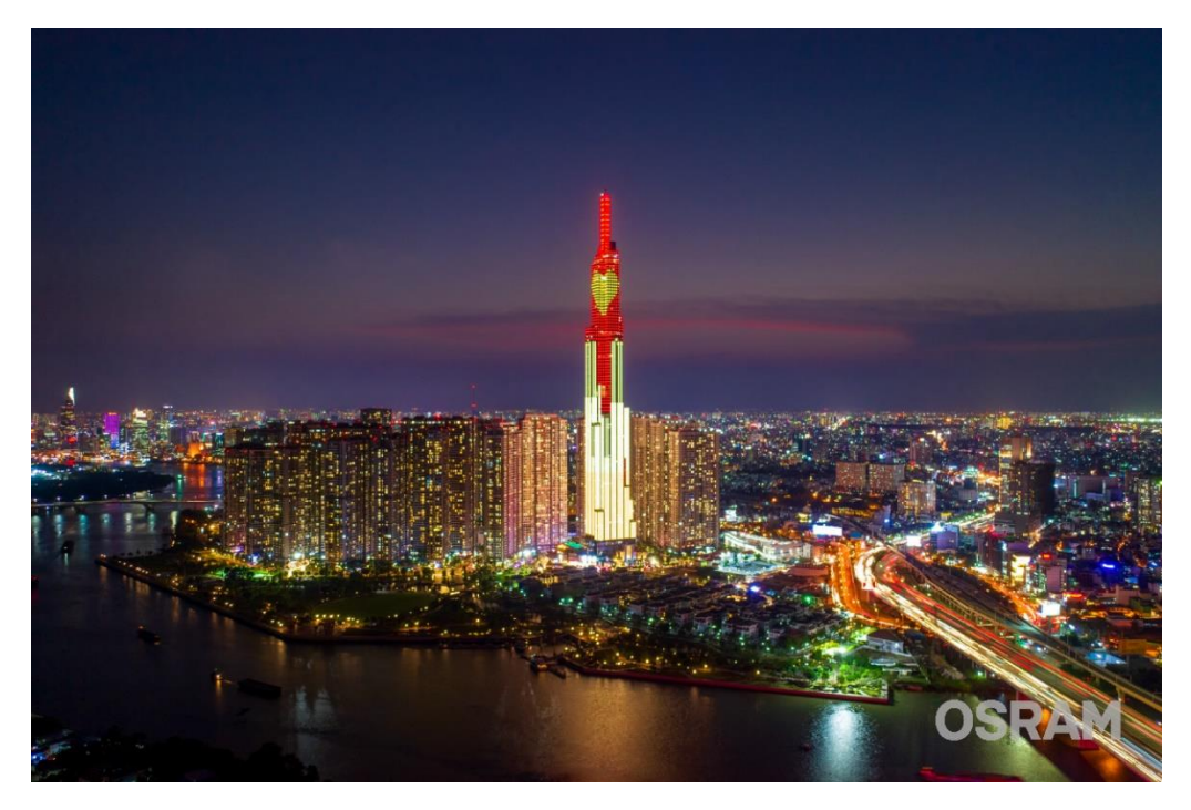
A gigantic heart at the top of Landmark 81, Southeast Asia's tallest skyscraper.

Osram subsidiary Traxon e:cue is a leading provider of LED systems and solutions with a focus on the fields of exterior architecture, hotel and catering (hospitality) and retail (shop). Traxon e:cue has installed more than 4,000 projects worldwide, including the Worldwide Plaza in New York, the 400-year-old Golden Temple in India and the Christ Monument on Corcovado in Rio de Janeiro.