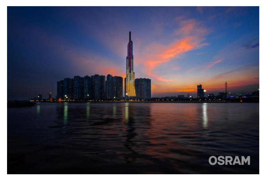
Traxon e:cue provides lighting solutions for Landmark 81, the Highest in Southeast Asia