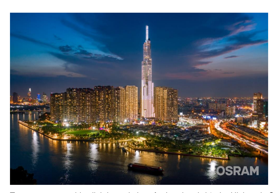
Traxon e:cue provides lighting solutions for Landmark 81, the Highest in Southeast Asia